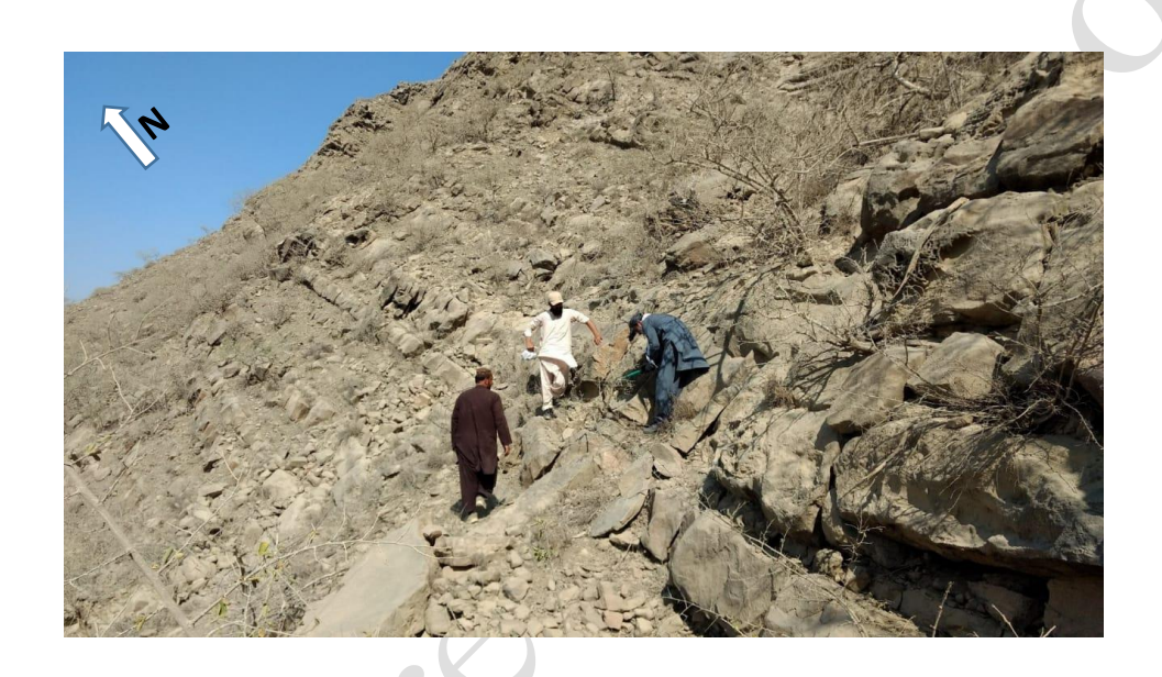
Fig. 2 Sampling from Pab sandstone in Pab Range.

XRF technique in analytical laboratory of Kohat cement limited. The Specific gravity of all sandstone samples was determined by standard method. The aim of specific gravity determination was to support the occurrence of sandstone with its subtle variations and with minor heavy minerals. Firstly, all samples were weighed in air then thin veneer of wax was coated on the rock sample surface to take its weight in the water. The ratio between weights in the air to the weight in water was calculated to determine specific gravity.